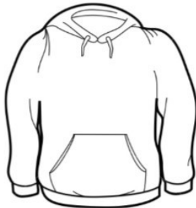
HOODED PULL OVER SWEATSHIRT S-XL $37.50 2XL-4XL $42.00