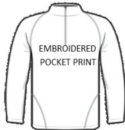
1/4 ZIP SWEATSHIRT S-XL $42.50 2XL-3XL $45.50