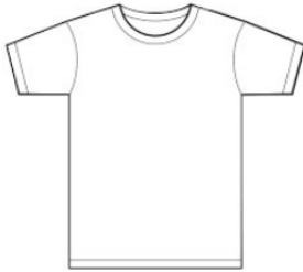
SHORT SLEEVE T-SHIRT S-XL $18.00 2XL-4XL $21.00