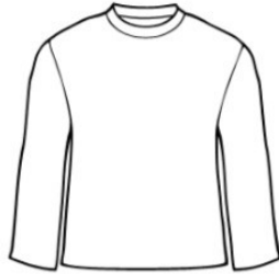
LONG SLEEVE T-SHIRT S-XL $25.00 2XL-4XL $28.00