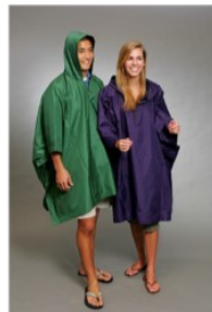
RAIN PONCHO—$55.00 PURPLE ONLY/FLEECE LINED